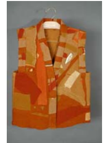
Pieced vest from felt scraps. Felt by Pirooska Toth

The class will include basic fitting and sewing techniques.